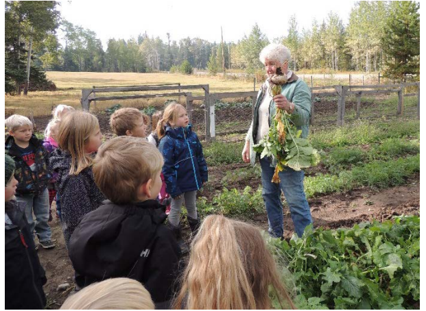
K/1 Solmonson Farm Visit