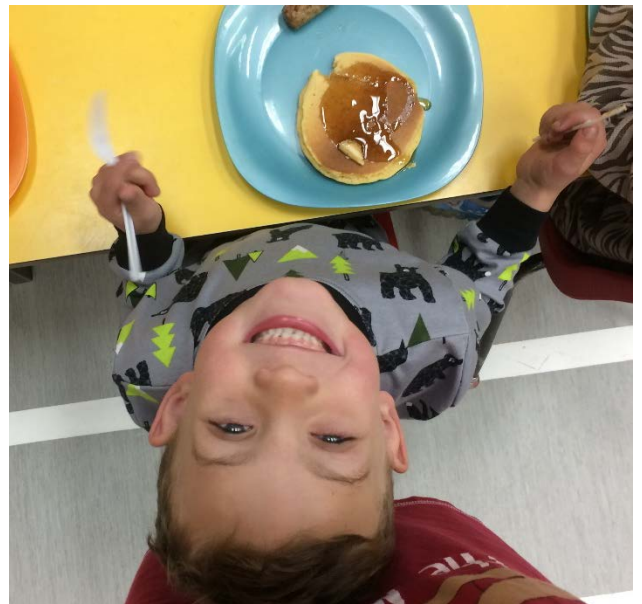
Pancake Breakfast/PJ Day!